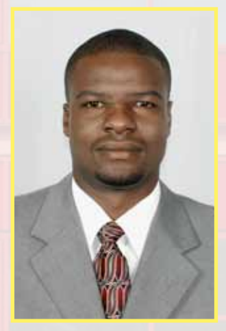
Director Moselli Industries Ltd Kenya Moselli Industries are manufacturers of quality powder soaps and other cleaning product, and sole distributors of Hyproclean

and improved sales of my products. I urge small companies to embrace the use standards in order to upgrade the quality of their products and access both local and export markets."